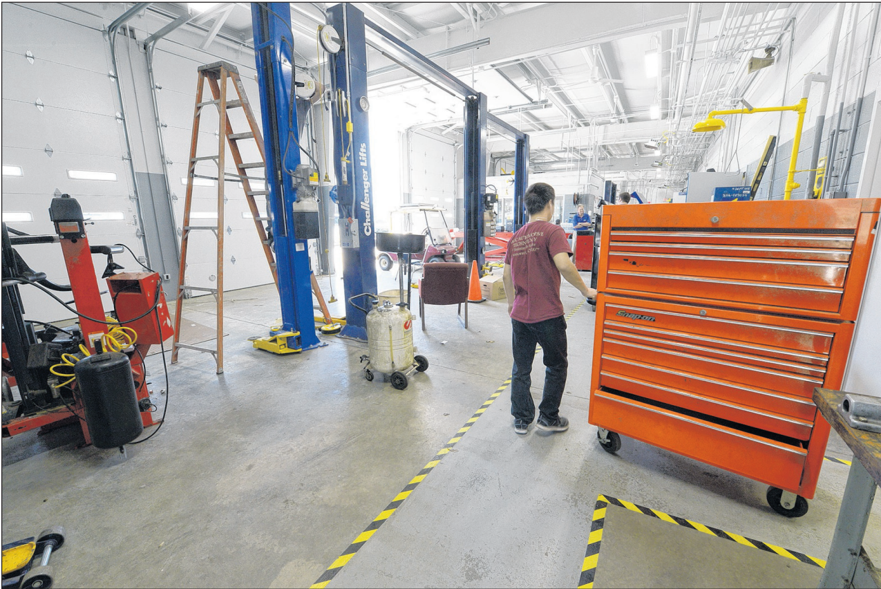
Alamance Community College's automotive systems technology shop opened back up this week after being displaced by a fire in January 2015. Picture above is one of the main garage bays; below is a new reception area for faculty, staff and students who bring in their cars for service.

down to Main Street in Graham at its eastern and southernmost point. The Eastern zone's border with the new high school would run along U.S. 70 and turn south on Gibson Road until it reaches Interstate 40/85, which it would follow to Orange County. The new high school's zone would border Southern's down N.C. 87 South out of Graham, See SCHOOL ZONE / Page A2