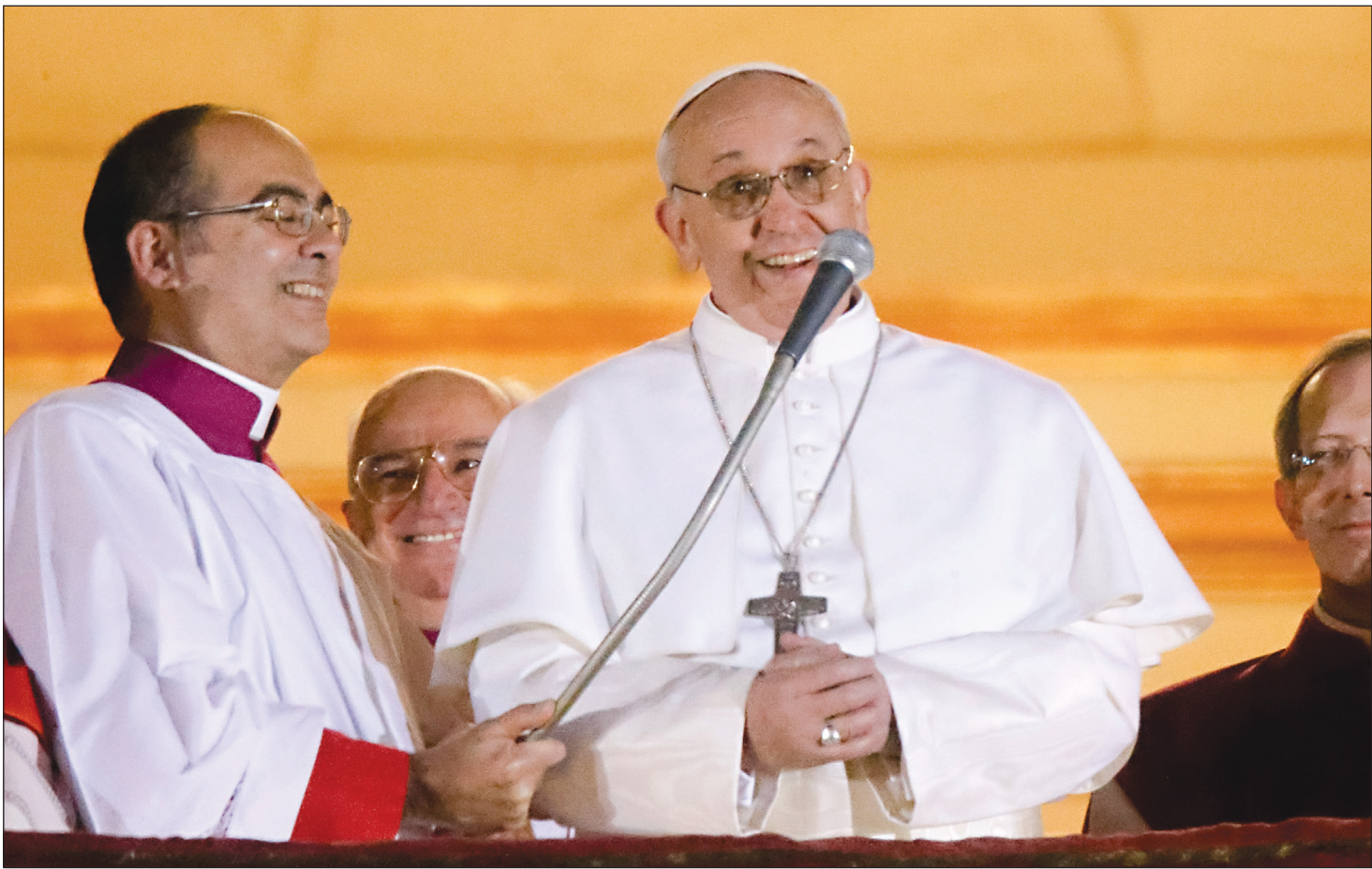
Pope Francis speaks from the central balcony of St. Peter's Basilica at the Vatican on Wednesday. The former Cardinal Jorge Bergoglio was elected on the fourth ballot, becoming the 266th pontiff of the Roman Catholic Church.

Cardinals elect Jorge Mario Bergoglio of Argentina; Buenos Aires archbishop becomes first pontiff from the Americas